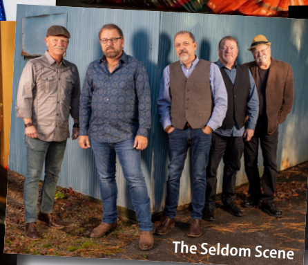
The Seldom Scene