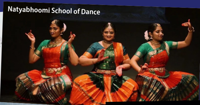
Natyabhoomi School of Dance