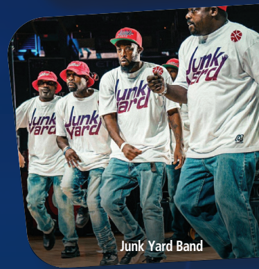
Junk Yard Band