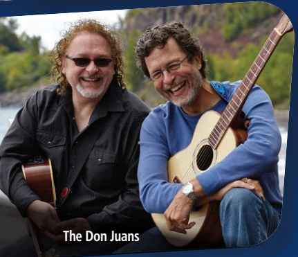
The Don Juans