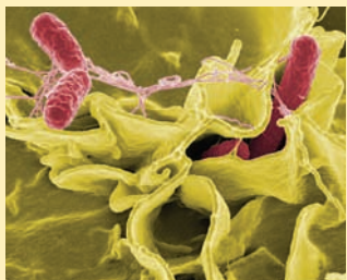
Rocky Mountain Laboratories, NIAID, NIH

Diseases and parasites may be transmitted from pet waste to humans or pets that have open wounds or depressed immune systems. Bacterial diseases like campylobacteriosis and salmonellosis can cause diarrhea and flu-like symptoms. Cryptosporidium, a protozoan