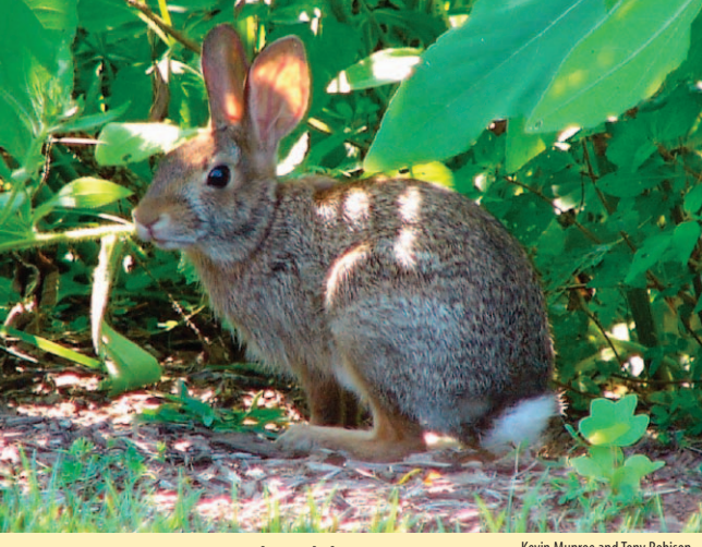
Eastern Cottontail Rabbit