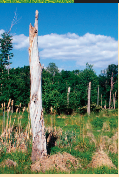
This may look like a dead tree to you, but it's a luxury condominium to hundreds of Fairfax County's