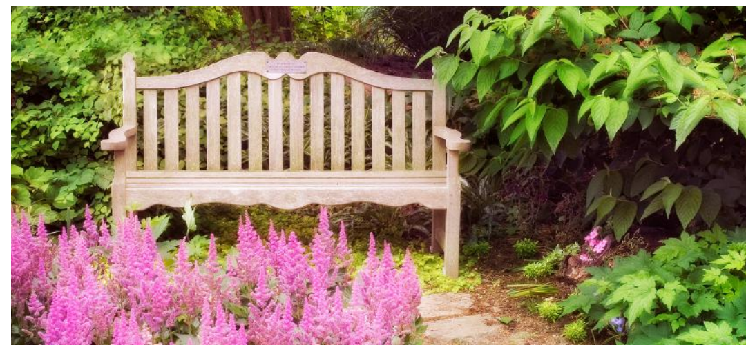
Benches tucked away off the path offer the perfect spot to sit and enjoy the gardens.

Green Spring's Garden Gate Plant Shop is open for in-person shopping Monday-Saturday 9:30 a.m. to 3:30 p.m., and Sunday Noon to 3:30 p.m. The Plant Shop specializes in plants that do well in local growing conditions, and offers many plants featured in Green Spring's demonstration gardens. Plant sales support the Friends of Green Spring (FROGS). It will remain open until late October.