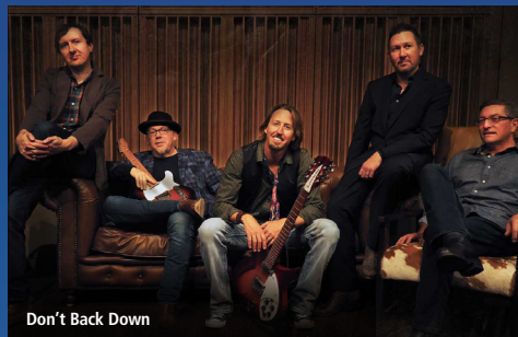
Don't Back Down