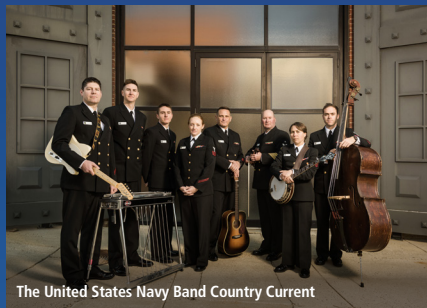
The United States Navy Band Country Current