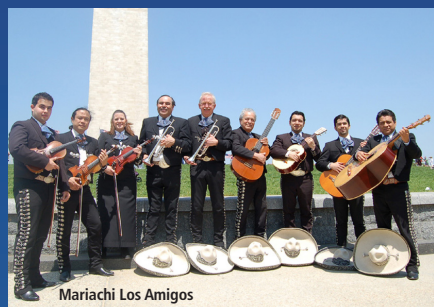
Mariachi Los Amigos