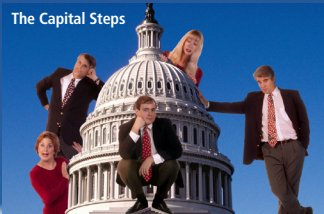
The Capital Steps