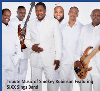
Tribute Music of Smokey Robinson Featuring SIXX Sings Band