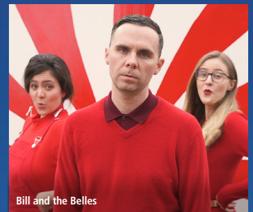
Bill and the Belles

Fairfax County Government Center 12000 Government Center Parkway, Fairfax