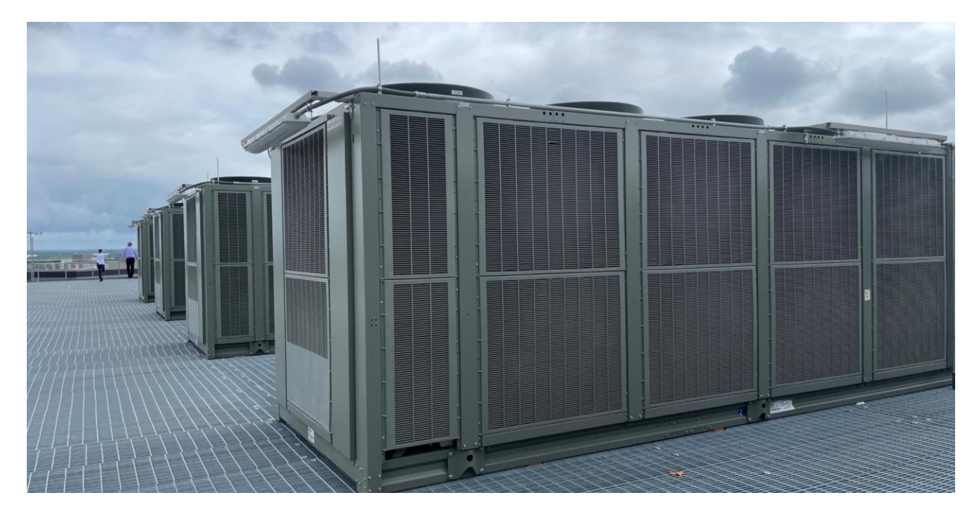
Air-cooled system, Stack Infrastructure, Manassas