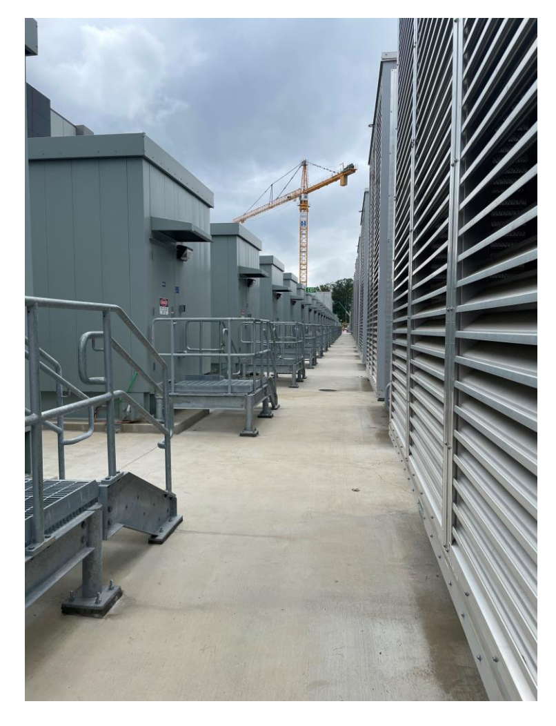
Generators (outside and inside enclosure), Stack Infrastructure, Manassas