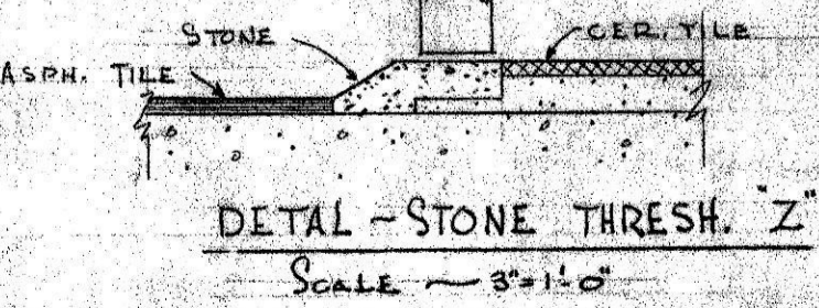
DETAIL - STONE THRESH. Z SCALE: 5/8" = 1'-0"

NOTES: ALL EXT. WALLS & INT. PARTS TO BE SOLID BRICK UNLESS OTHERWISE NOTED.