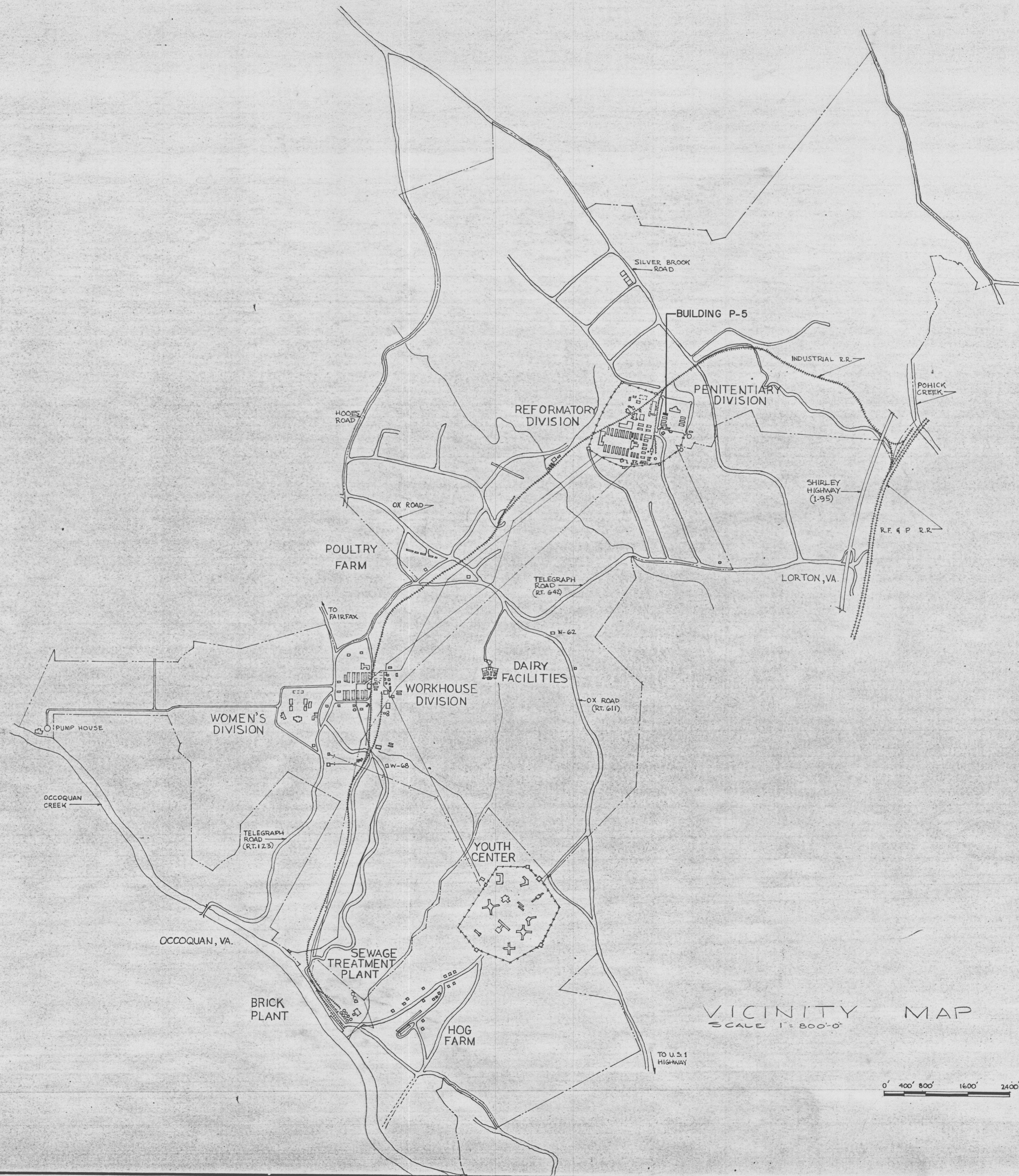
VICINITY MAP SCALE 1" = 800'-0"