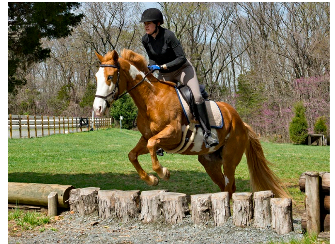
Riding or Boarding Stable