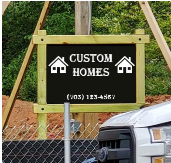
Figure 3: Example of a Sign During Active Construction or Alteration

Staff Recommendation: Staff recommends codifying the interpretation in the future Phase II amendment to the Sign Ordinance by clarifying what constitutes the commencement of construction for this purpose.