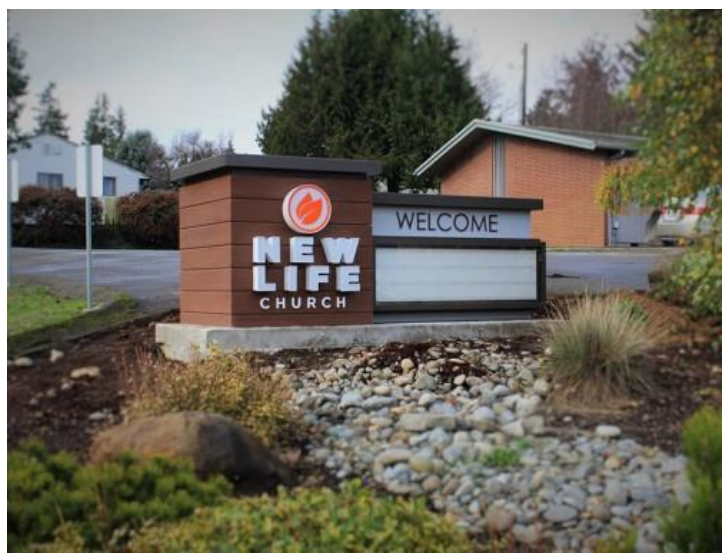
Figure 4: Example of a Freestanding Sign

Staff Recommendation: As previously discussed, complaints have been received related to the presence of too many signs and on the size of signs for nonresidential development in residential zoning districts, and staff has received comments recommending that the maximum sign area be tied to lot size. However, staff does not recommend any changes at this time, but will continue to monitor these complaints and will have these be a focus area during upcoming outreach and education efforts. As with residential dwellings, an amendment limiting the overall maximum signage for nonresidential uses in residential districts, inclusive of minor signs and freestanding signs, could be considered to further limit the cumulative impact of signs in residential districts.