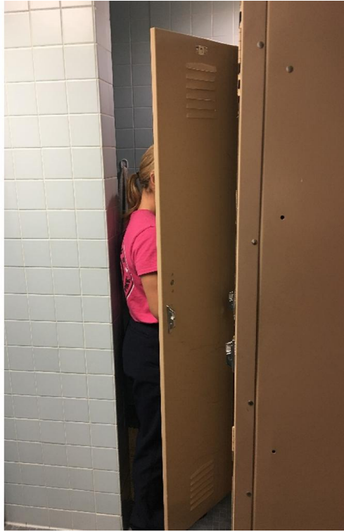
Female shower & locker area inadequate.