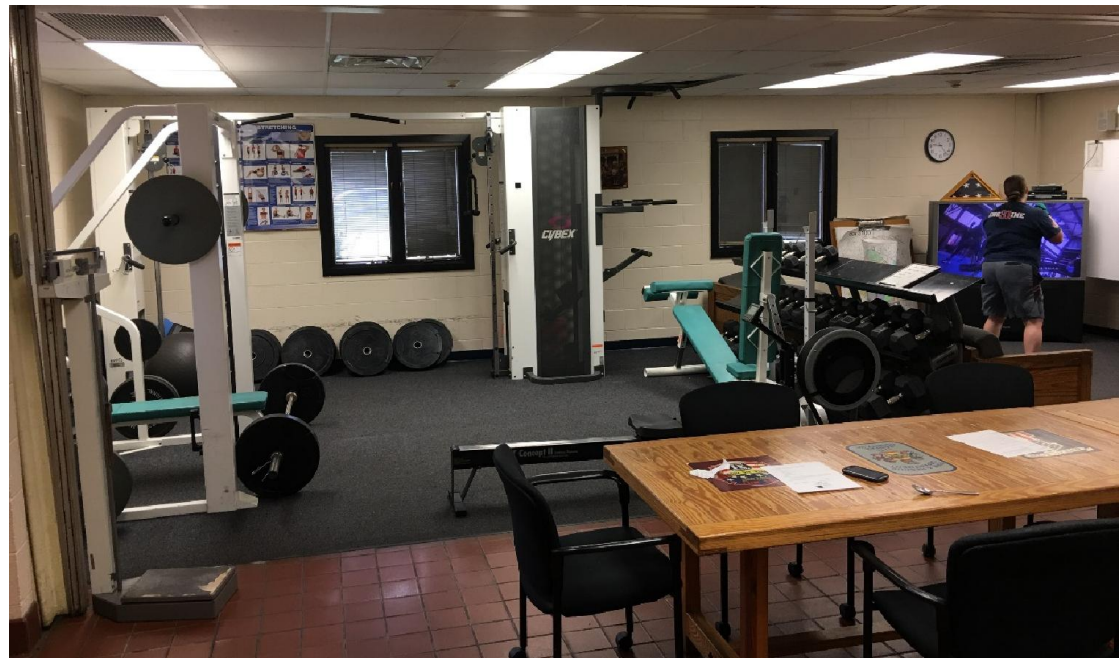
Gym/fitness equipment located in day room/kitchen area.