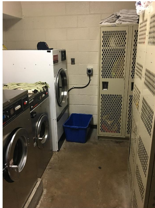
Protective gear storage shared with laundry room which is a health concern.