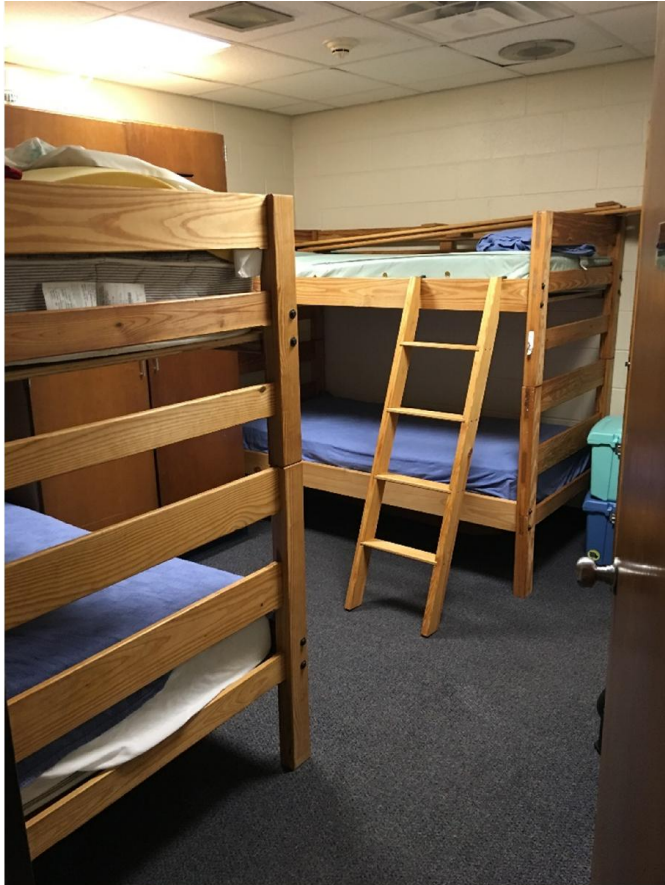
Female bunkroom has two bunk beds which is a safety issue.

Protective gear room shared with laundry room which is a health concern.