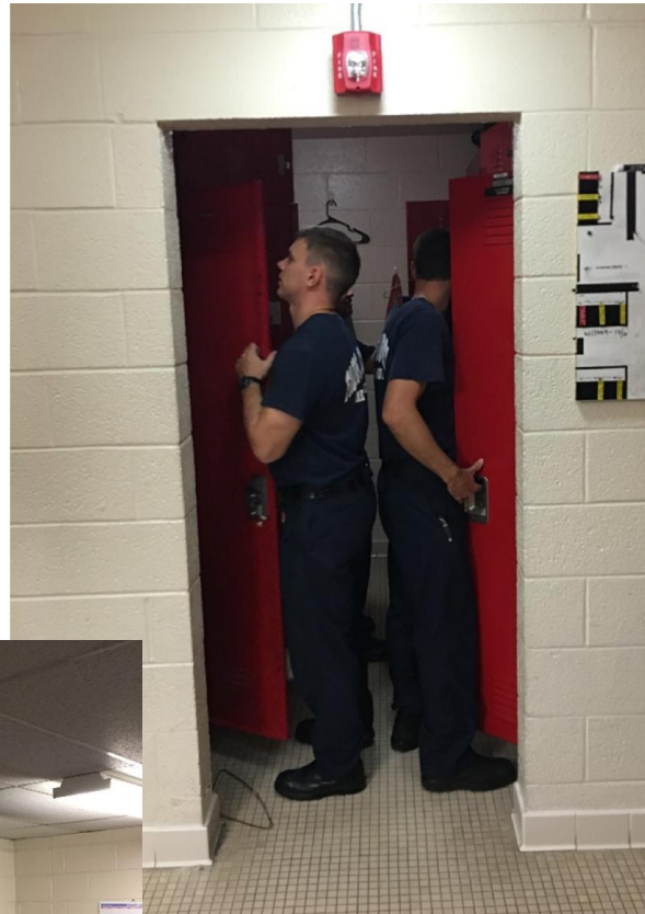
Men's locker room extremely crowded.