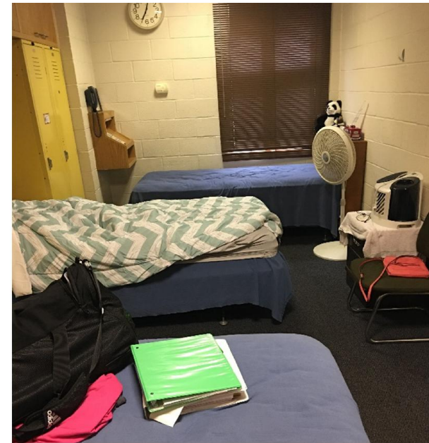
Small female bunkroom.