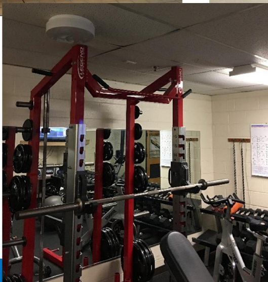
Small bunkroom converted into gym with low ceiling.