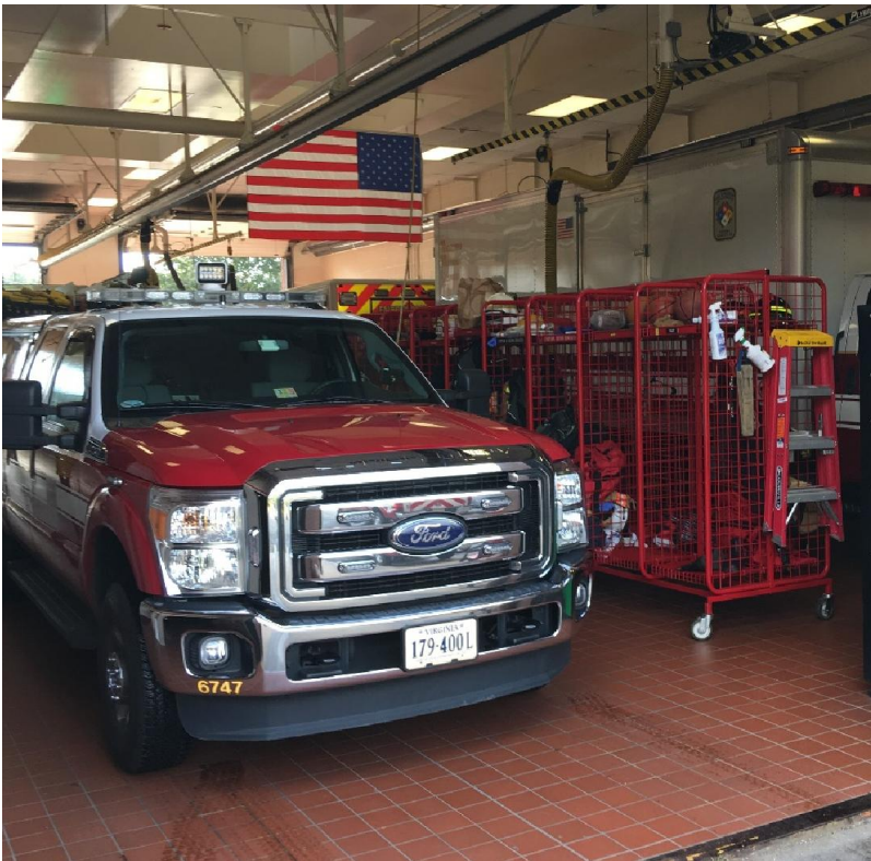
Protective gear lockers located in apparatus bays between vehicles.