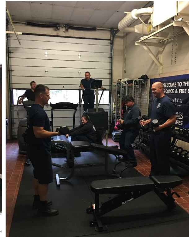
Gym is converted ambulance bay and not climate controlled.