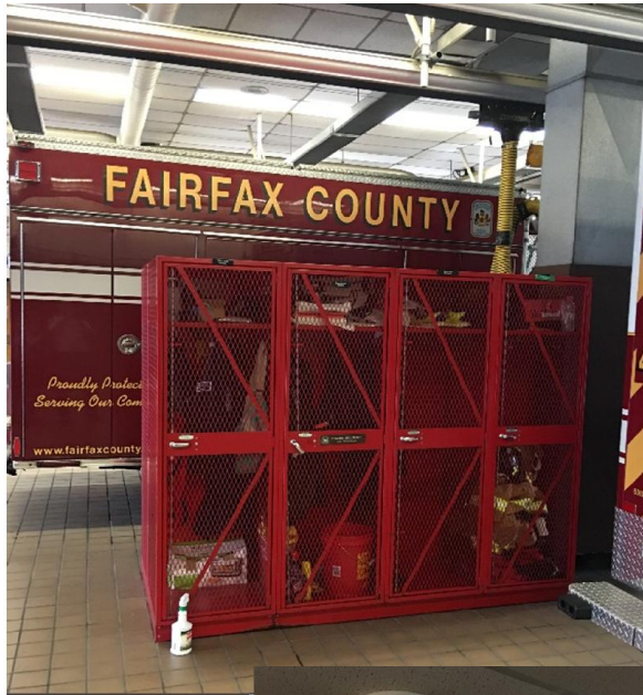
Protective gear storage in apparatus bays.