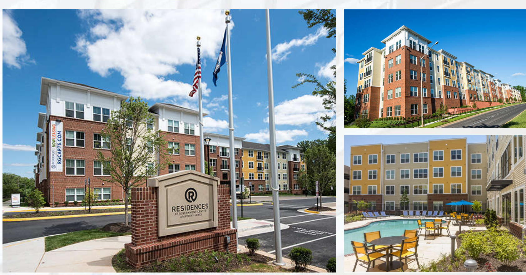
Residences at the Government Center