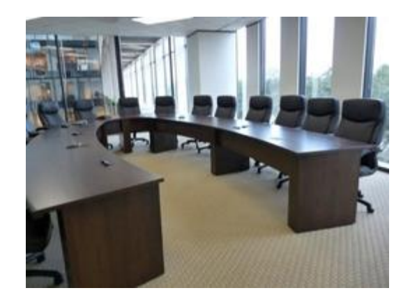
<u>Exhibit F</u> Depiction of Desk for the Meeting Space Facility