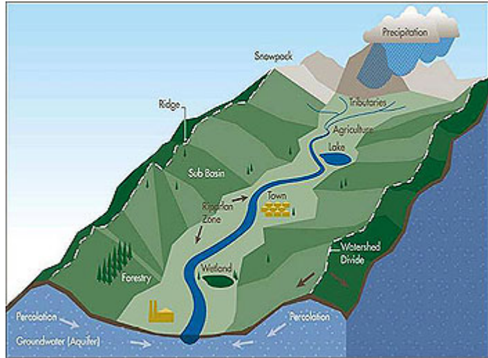
Figure 1-1: Diagram of a watershed

The boundary of a watershed is defined by the watershed divide, which is the ridge of highest elevation surrounding a given stream or network of streams. A drop of rainwater falling outside of this boundary will enter a different watershed and will flow to a different body of water.