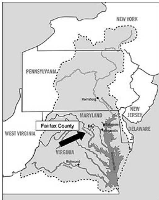
Figure 1-2: The Chesapeake Bay watershed

Streams and rivers may flow through many different types of land use in their paths to the ocean. In the above illustration from the U.S. Environmental Protection Agency, water flows from agricultural lands to residential areas to industrial zones as it moves downstream. Each land use presents unique impacts and challenges on water quality.