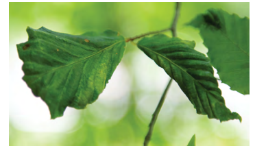
Figure 2.—Banding appearance and shrunken leaves associated with BLD.