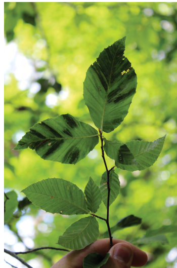
Figure 1.—Banding appearance associated with BLD.

BLD range appears to be spreading primarily toward the east based on the locations of new county detections in recent years. The nematodes are possibly dispersing aurally by wind and precipitation. Additional nematode dispersal modes currently being studied include insect and avian vectors as well as human-mediated movement. There is likely a delay between initial nematode infestation and BLD detection as L. crenatae has occasionally been confirmed in asymptomatic tissue at the molecular level before symptoms are observed.