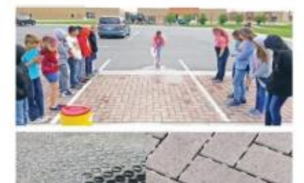
Pervious Pavement Types