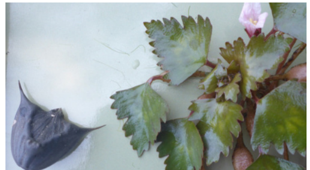
Trapa bispinosa seed, rosette of leaves and pink flower.