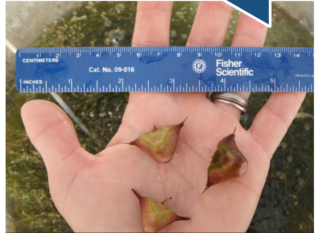
Trapa bispinosa mature fruit in September.

Responding to small populations can be quite easily managed by harvesting the plants before fruits set. Larger infestations may require more drastic measures. Please see links below for more information and options for helping to stop the spread of trapa.