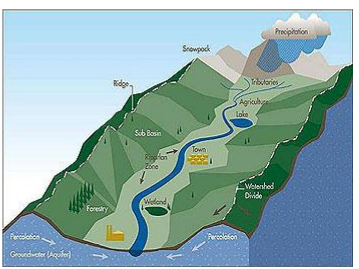
Figure 1-1 Diagram of a watershed

The boundary of a watershed is defined by the watershed divide, which is the ridge of highest elevation surrounding a given stream or network of streams. A drop of rainwater falling outside of this