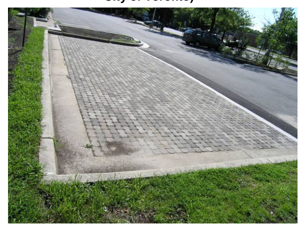
Figure 4-21: Permeable pavement blocks in a parking lot

requirement for an underdrain if the soils below the surface are not permeable and will not allow the runoff to infiltrate. Maintenance is also required to prevent sediment from clogging the surface and preventing the water from infiltrating through the surface.