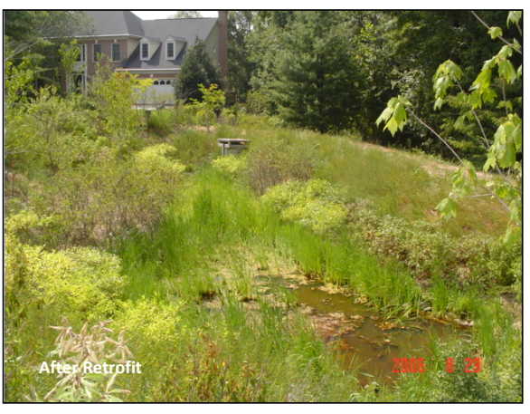
Figure 4-3: Stormwater dry pond retrofit