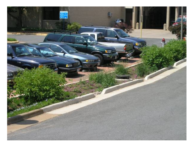
Figure 4-7: Parking lot bioretention