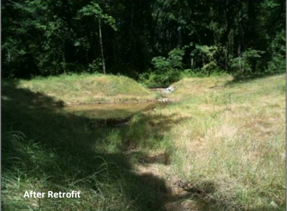
Figure 4-17: Outfall improvement