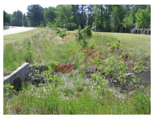
Figure 4-13: Vegetated swale for roadside drainage

However, because of the proximity to roads and utilities, infiltration systems and vegetated swales may only be feasible in lower-density residential areas.