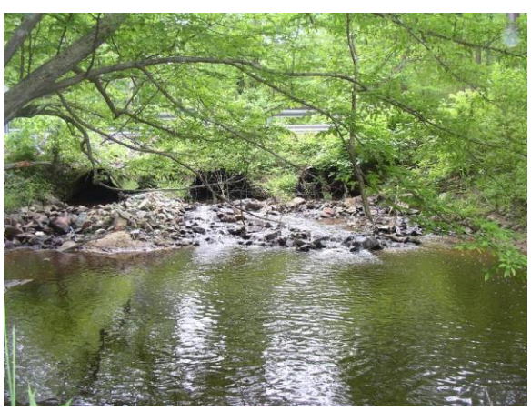
Figure 4-15: Obsolete culvert

These improvements can include raising the roadbed above the flood level, rebuilding culverts so they can pass more water, replacing worn or damaged culverts with newer ones that allow water to flow