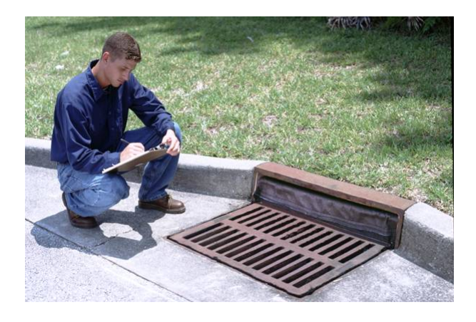
Figure 4-14: Inlet filter