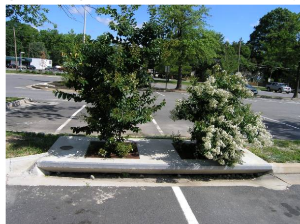
Figure 4-9: Tree box filter