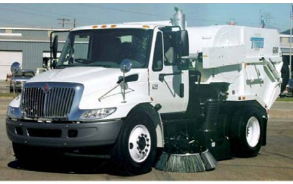
Figure 4-27: Street sweeper

There is a wide range of variability and efficiency among street sweeping equipment. Mechanical sweepers are effective for larger particles and cleanup of winter deicing materials. Much of the pollutants picked up by stormwater runoff consist of smaller particles in the micrometer range. A regenerative air sweeper can be effective at removing this material. Frequency of sweeping activities is also a key factor in pollutant removal efficiency.