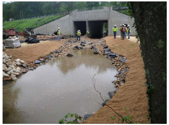
Figure 4-16: New replacement culvert

more quickly. The example shown in Figures 4-15 and 4-16 include all of these techniques, with the roadway height increased and the larger double box culvert replacing the three smaller round metal ones.