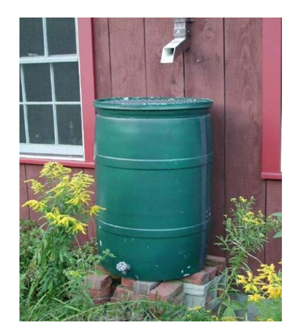
Figure 4-19: Rain barrel

The use of pervious pavement systems can provide a form of disconnection for parking lots, driveways, walkways and other hard surfaces. These systems may consist of a special asphaltic paving material (porous pavement), a special concrete material (porous concrete) or open jointed concrete blocks (permeable pavement blocks). They allow stormwater to infiltrate directly through the surface instead of flowing to a collection system. The most significant constraint is the