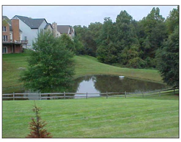
Figure 4-2: Stormwater Management wet pond