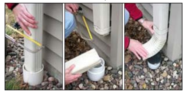
Figure 4-20: Disconnecting a downspout