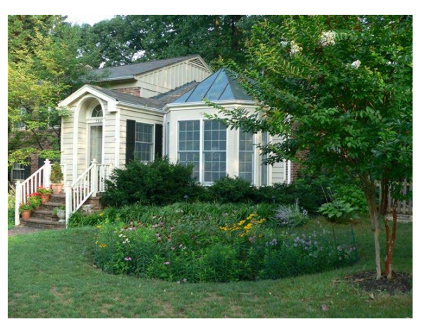
Figure 4-12: Residential rain garden