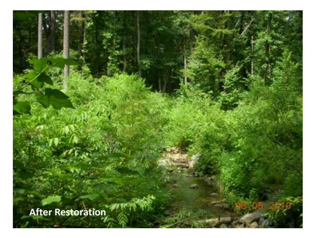
Figure 4-4: Stream restoration

restoration design could include using grade controls to flatten the slope of the stream and dissipate stream energy.