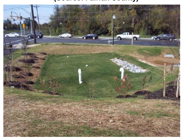
Figure 4-11: Sand filter along MD355