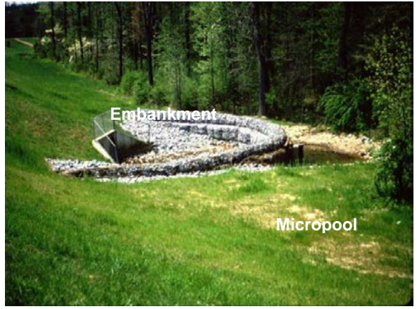
Figure 4-6: Culvert retrofit, flow right to left

If the upstream area is an open floodplain, it may be possible to construct an off-line wet pond or stormwater wetland to improve water quality treatment. Since roadway embankments are not usually designed to impound water, special design measures are necessary, particularly a new embankment built upstream of the culvert.