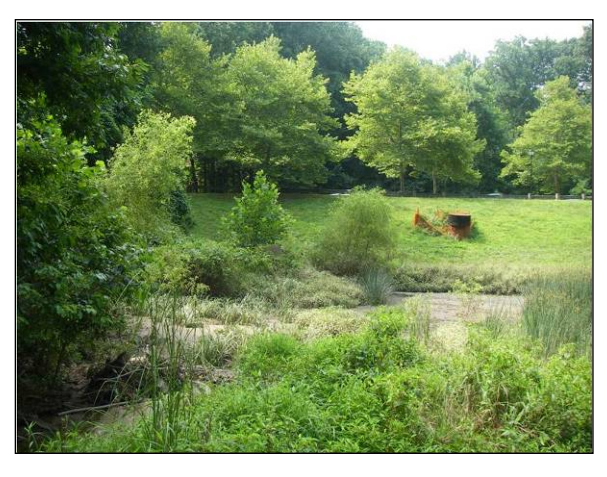
Figure 4-1: Engineered stormwater wetland

3. Stormwater wetlands, which function similarly to a wet pond but are landscaped to provide better treatment of dissolved nutrients and aquatic habitat for a wider variety of species.