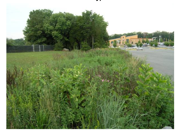
Figure 4-8: Vegetated swale