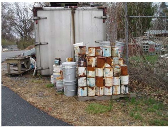
Figure 4-25: Improperly stored outdoor materials

Protecting outdoor material storage areas is a simple and effective pollution prevention practice for many commercial, industrial, institutional, municipal and transport-related operations. The underlying concept is to prevent runoff contamination by avoiding contact between outdoor materials and rainfall (or runoff). Examples include salt storage areas for highways, manure storage on farms, or excavated soil from construction sites.