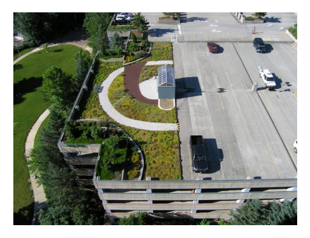
Figure 4-10: Green roof on a parking building

Rain gardens are essentially a nonengineered form of bioretention that treats rooftop runoff from individual roof leaders or overland runoff. They consist of small, landscaped depressions with a sand/soil mixture planted with native shrubs, grasses or flowering plants. Runoff is detained in the depression for no more than a day. Rain gardens can replenish groundwater, reduce stormwater volumes downstream and remove pollutants.