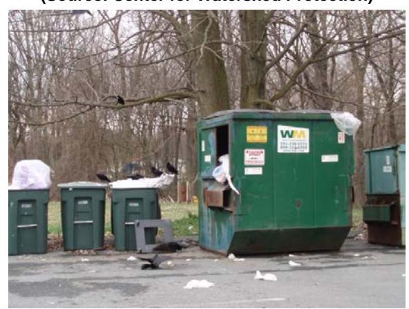
Figure 4-26: Improper dumpster maintenance

Dumpsters provide temporary storage of solid waste at many businesses and can be a significant pollution source if improperly maintained. Many dumpsters are open, which allows rainfall to mix with the wastes, generating a source of trash, oil and grease, metals, bacteria, organic material, excess nutrients and sediments. Good dumpster management is particularly important to reduce trash loadings to a stream.