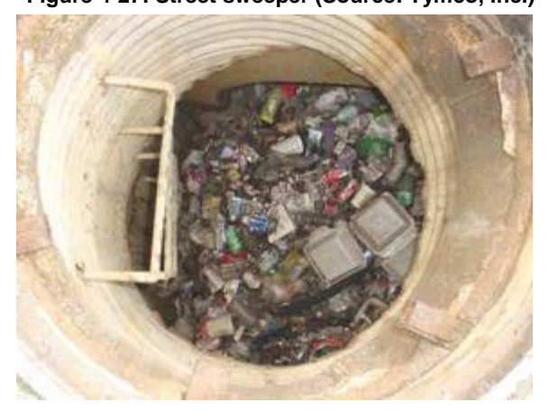
Figure 4-28: Catch basin

An alternative to street sweeping is catch basin cleaning, which consists of periodically opening storm drain inlets and removing the material that has accumulated at the bottom. However, resident outreach and education is needed to stop the practice of disposing of materials into storm drain inlets.