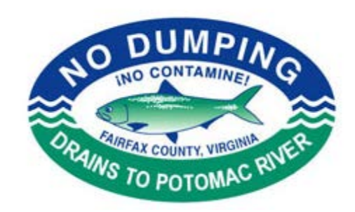
Figure 4-24: Fairfax County storm drain label (Source: Fairfax County, label produced by Das Manufacturing, Inc.)

sidewalks and streets can increase the tree canopy, increasing evapotranspiration and interception, slowing runoff and allowing more infiltration as it is absorbed into the ground. Trees also reduce erosion by holding soil and by reducing the impact of rain to bare ground. The program is a good opportunity to involve park and neighborhood supporting groups.