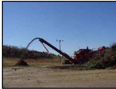
Table 8-3, below, shows the quantities of yard waste recycled by these three methods. In 2002, the county sent 54,061 tons of yard debris to out-of-county composting facilities, the majority (32,133 tons) to the Prince William County Compost Facility at Balls Ford Road and a smaller amount (21,928 tons) to Loudoun Composting in Loudoun County.

Brush and vacuum leaves are mulched or ground and made available at no cost to county residents. In 2002, Fairfax County ground 48,196 tons of brush and 2,150 tons of vacuumed leaves.