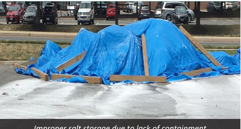
Improper salt storage due to lack of containment

Salt contains chloride, which is toxic to aquatic and plant life. It corrodes equipment and damages infrastructure. Salt also contains sodium which, once it enters our waterways, is not removed by wastewater treatment or even drinking water treatment processes. Salinization of the nation's waters is a growing concern and regulatory efforts are currently underway to reduce salt inputs to the environment.