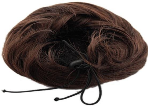
Fashion Donut Clip-on Dish Hair Bun – Secured to natural hair using the built-in hair clips and elastic strings attached to weave.