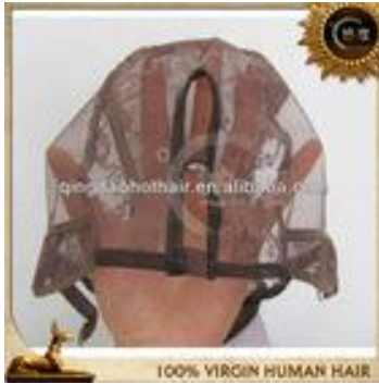
Cap Hair Weave Net – Weave is sewn onto the cap then applied to head.