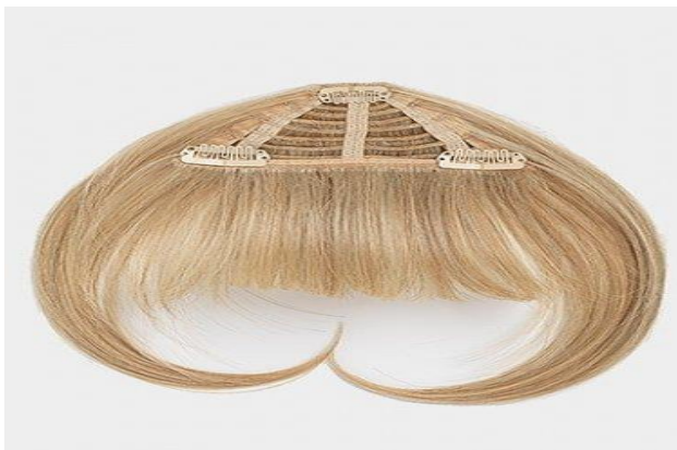
Hair Clip – Clips to natural hair (three built-in hair combs)