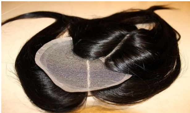
Lace Closure Wig (top and bottom) – A lace closure is attached to make a full weave look more natural.