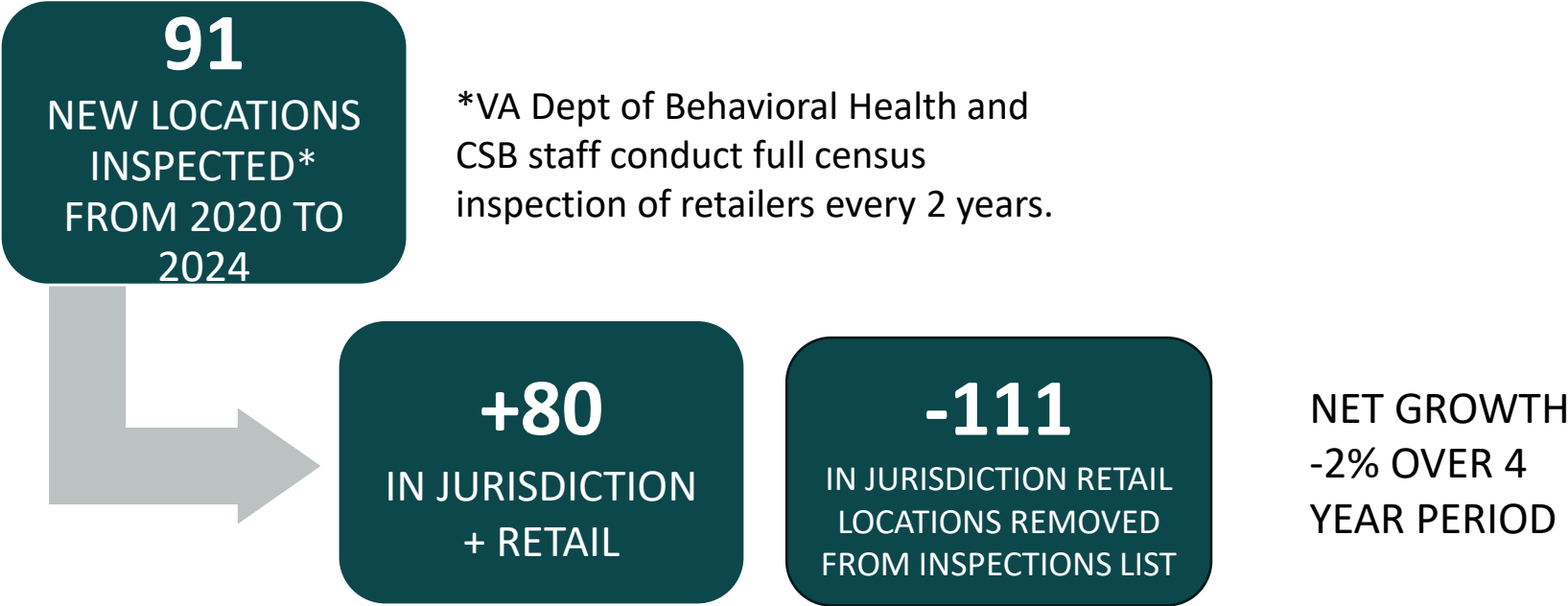
FIGURE 2. TOBACCO RETAIL CHANGE OVER TIME, FAIRFAX COUNTY, 2024

BASED ON DATA AS OF 12/31/24 REGULATION DOES NOT APPLY TO LOCATIONS OPERATING PRIOR TO JULY 1, 2024.