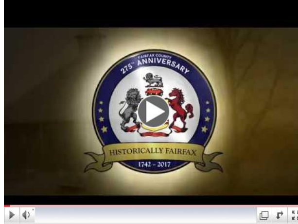
Fairfax County Virginia - A 275th Anniversary Timeline