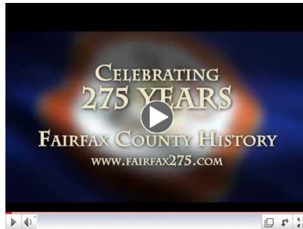
Fairfax 275 Celebration - Weights and Measures

Watch Fairfax County's 275th Commemoration videos on YouTube: