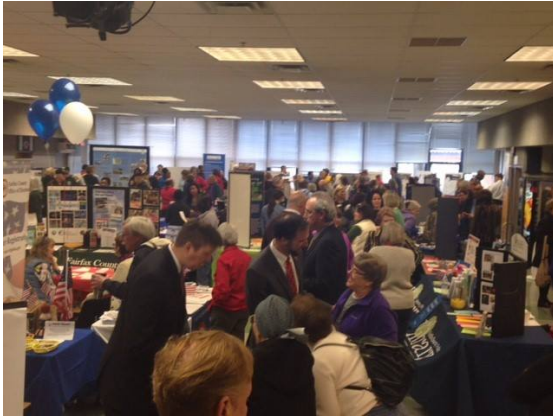
Exhibit Hall, Mount Vernon District Town Meeting