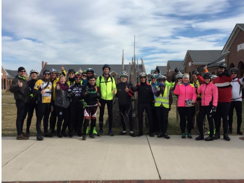
Inaugural Tour de Mount Vernon Participants

Thanks to the dozens of cyclists who came out on New Year's Eve for the inaugural "Tour de Mount Vernon" bike ride. The informal bike ride began at Belle Haven Park on the George Washington Parkway (GWP). The 25 mile one-way or 50 mile round-trip ride follows the GWP trail to Mount Vernon Estate and continues on ultimately ending at the Workhouse Arts Center.