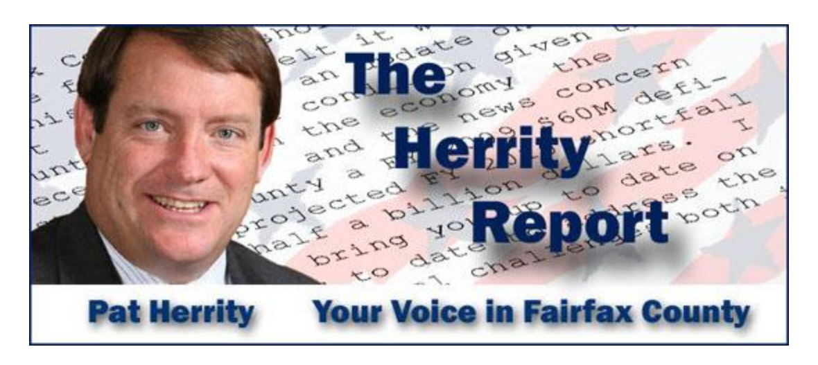
August 16, 2016