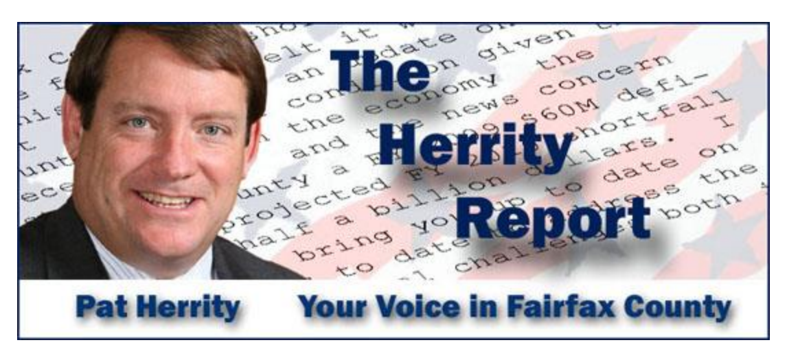
September 2, 2016