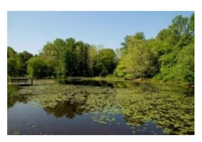
Garden Clean Up at Ellanor C. Lawrence Park

Fall may have just started but it is time to plan ahead. At the end of the fall season, the gardens at Ellanor C. Lawrence Park need some help! As part of