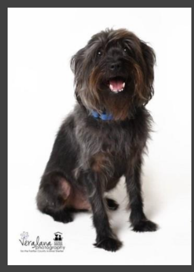
Meet Sgt. Pepper!