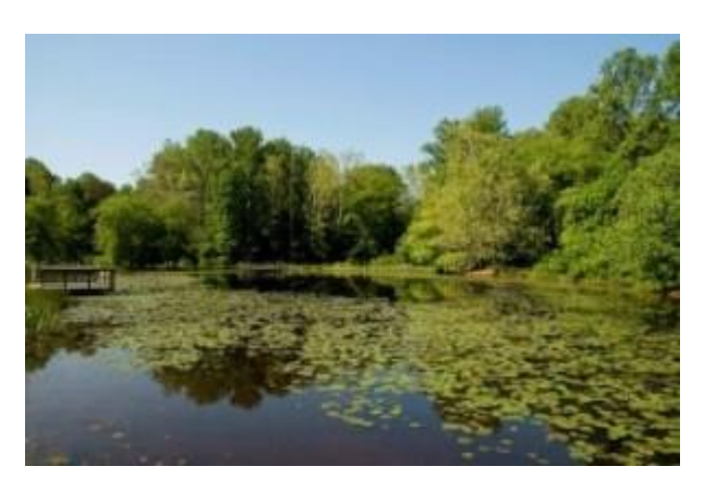
Ellanor C. Lawrence Watershed Clean-up

Keep our waters clean. Collect trash from streams and trails. Compile and report results. Great for school or scout service hours. Groups please call location to apply.