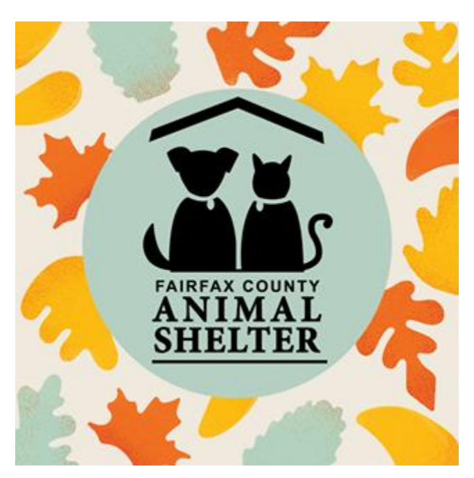
Fairfax County Animal Shelter Volunteer

The Fairfax County Animal Shelter has over 400 active volunteers, and so much of the shelter's lifesaving work is because of their amazing efforts! Want to join them? Read on for their requirements and what type of things volunteers do around the shelter.