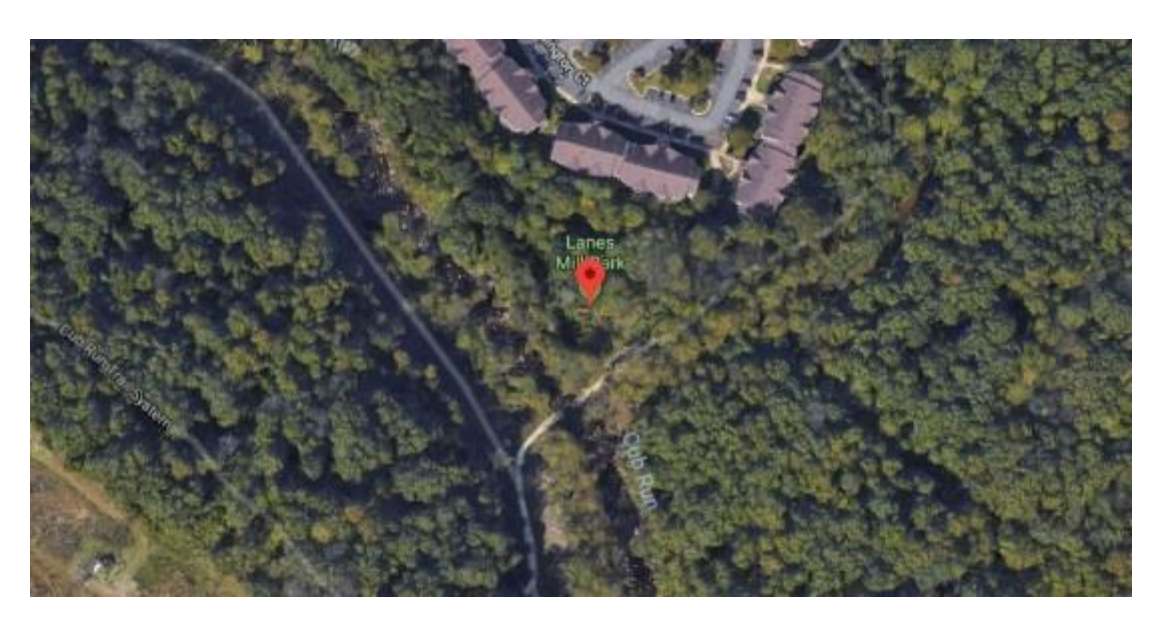
Lane's Mill Work Day

The Historic Sites Volunteer Corps is looking for volunteers to help with a landscape clean-up at Lane's Mill on Saturday, November 10 from 8:30 a.m. to 1:30 p.m. Located at the confluence of two streams, this cultural site is at risk of further damage by flood waters. Clearing the overgrowth and invasive plants will help the Park Authority protect the ruins of this 1760 mill and allow for detailed documentation. This volunteer opportunity would be great for anyone interested in history, architecture, landscaping, gardening, and community outreach. To register, click <a href="here">here</a>.