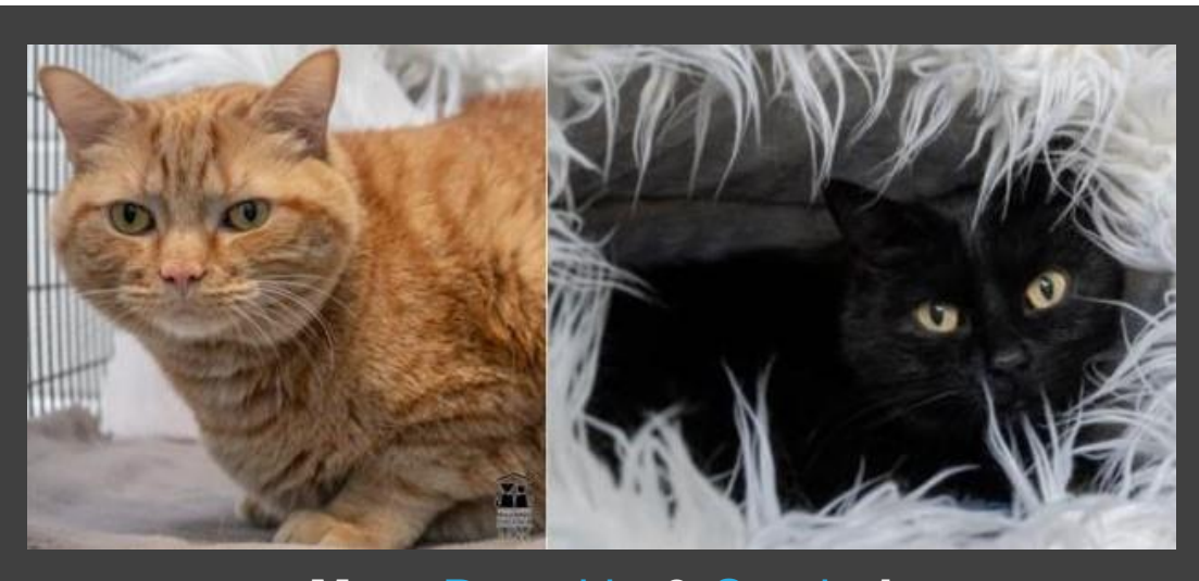
Meet Pumpkin & Spyder!

Pumpkin is a pretty good name for this guy. He's orange, he's round, and he weighs 16 pounds! He and his best friend Spyder were surrendered to the Fairfax County Animal Shelter when their owner could no longer care for them due to an allergy in the home, and the shelter is determined to find them a home together! They've lived together their whole lives and got really stressed