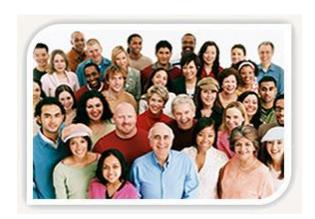
Meals on Wheels

Meals on Wheels Drivers pick up meals and deliver them to individuals on a specific route. Routes take a maximum of 2 hours to deliver all meals. Deliveries are made midday Monday, Wednesday, and Fridays, except in the Annandale/Falls Church region, where it is done Monday through Friday. Deliveries can be made by an individual or as part of a volunteer group. Opportunities available throughout Fairfax County close to where you live or work!