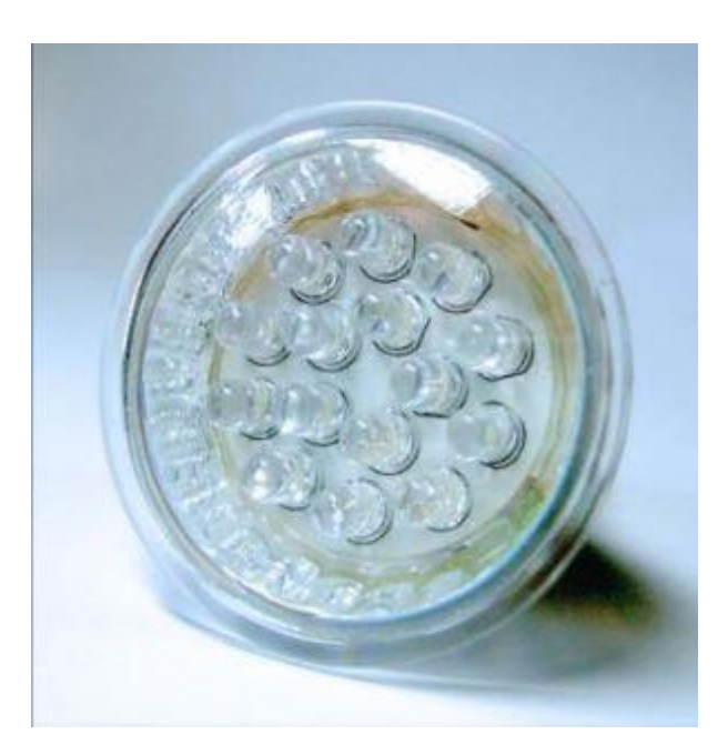
Fairfax County Energy Initiatives

As part of the FY 2018 Carryover Review , funding in the amount of $4.5 million was approved to support Fairfax County's Operational Energy Strategy. The Energy Strategy was adopted by the Board on July 10, 2018, and includes plans to move the County forward toward its goal of reducing energy use by 20 percent by 2029. The funding provides for the first-year investment in the Operational Energy Strategy and includes lighting retrofit projects throughout the County.