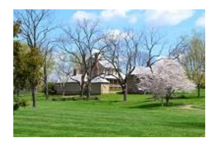
2018 Springfest Earth Day Festival

Springfest is Fairfax County's premier Earth Day festival held on April 21 at Sully Historic property in Chantilly, VA. The theme of this year's event is "Healthy Planet-Healthy People". The event will offer workshops, vendors, and activities to help us improve our health and environment. The day-long