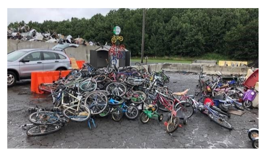
Give Your Bicycle a Second Life

Did you know the <u>Solid Waste Management Program</u> has collected more than 5,000 used bikes that have been sent to people all over the world? If you or your child has outgrown their bicycle, please consider bringing it to the <u>I-66 transfer station in Fairfax or the I-95 landfill complex in Lorton</u>. Look for the colorful bike donation signs.