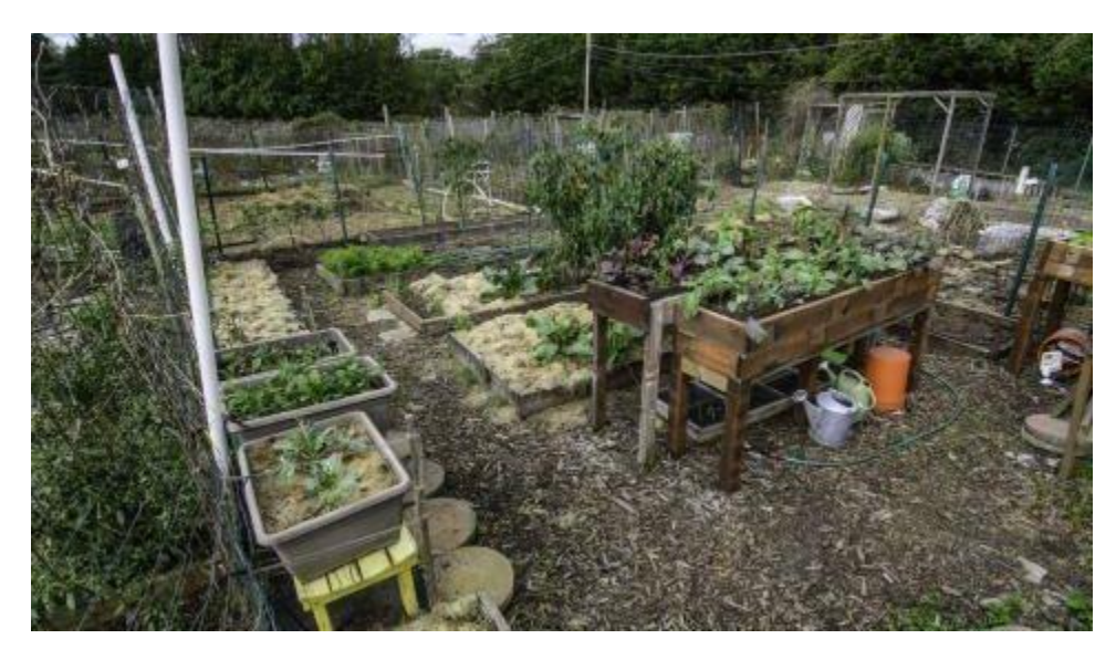
Green Spring Gardens Rental Plots

The <u>Fairfax County Park Authority</u> rents more than 650 garden plots in <u>nine county parks</u> on an annual basis to Fairfax County residents. Gardeners who keep their plots in compliance are offered renewal leases for subsequent years. Most plots are approximately 20' x 30'. The annual rental fee is $130, which includes a shared water supply. An exception is Eakin Park, where there is no water supply and the plots rent for $125 per year.