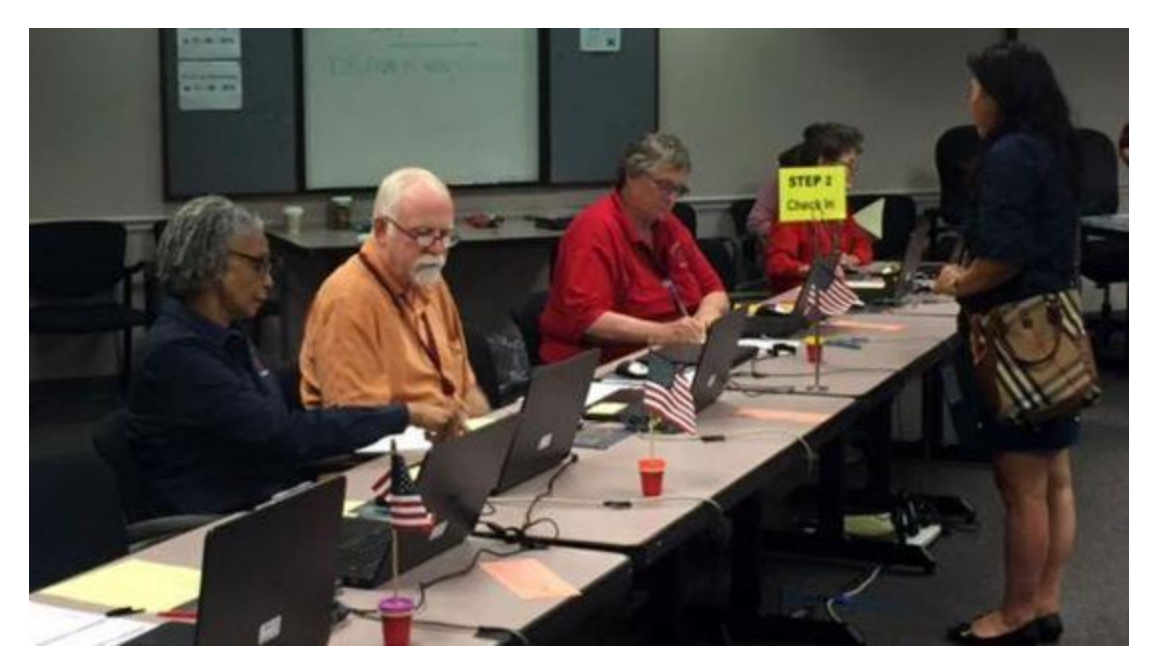
Election Officers Needed for June 11, 2019 Primary Election

Fairfax County needs election officers for the Tuesday, <u>June 11, 2019, Democratic primary election</u>. There have been no calls for primaries by the Republican Party.