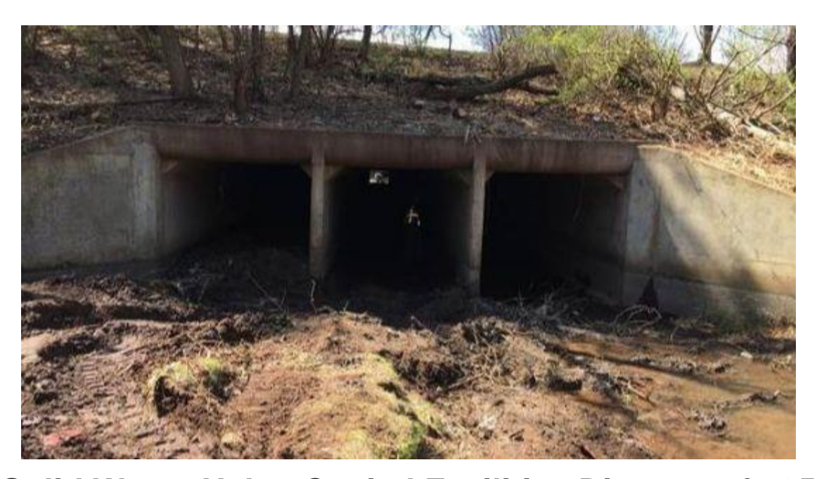
Solid Waste Helps Capital Facilities Dispose of 785 Tons of Contaminated Dredge

Solid Waste and the Maintenance and Stormwater Management Division (MSMD) recently helped Capital Facilities' Utilities Design and Construction Division (UDCD) complete an aspect of a developer default project in the Sully District. As part of the Virginia Department of Transportation's (VDOT) street acceptance process for the 38,000 square-yard roadway system, VDOT required Fairfax County to remove sediment deposits from a 250-foot-long triple box culvert under Trinity Parkway before the state agency could inspect the culvert's structural integrity.