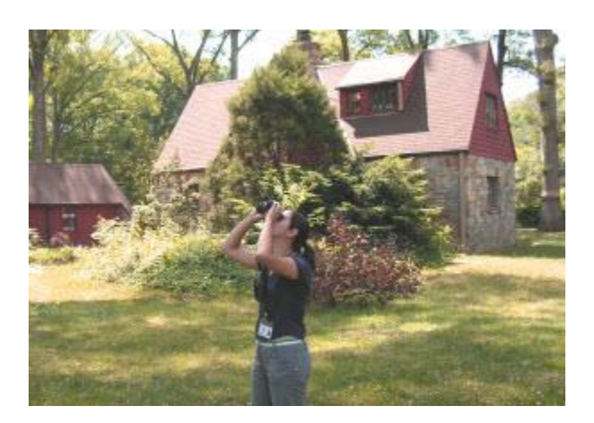
Gypsy Moth Volunteer Monitoring

Urban Foresters need your help for a new volunteer outreach program to identify and report invasive insects called gypsy moths. Online training is available.