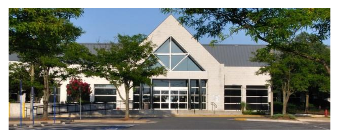
Chess Club Leader (Centreville Regional Library)