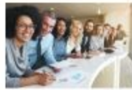
Citizen Corps Council