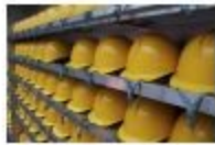
Architectural Review Board