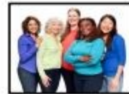
Commission for Women