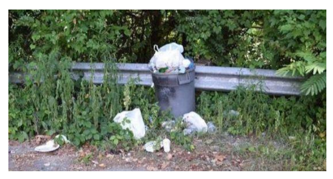
New Litter Resources & Reporting Page

The <u>new litter webpage</u> includes volunteer opportunities, a list of things you can do to prevent litter, and a way to report litter in your community. Reporting litter allows the county to track down the property owner or organization responsible for picking it up. The county will investigate and get back to you or forward your request to the responsible organization. Please be patient while they investigate and respond. Let them know what you saw and where you saw it by calling 703-324-5230, or email trashmail@fairfaxcounty.gov.