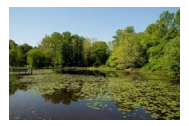
Native Plant Festival Volunteer