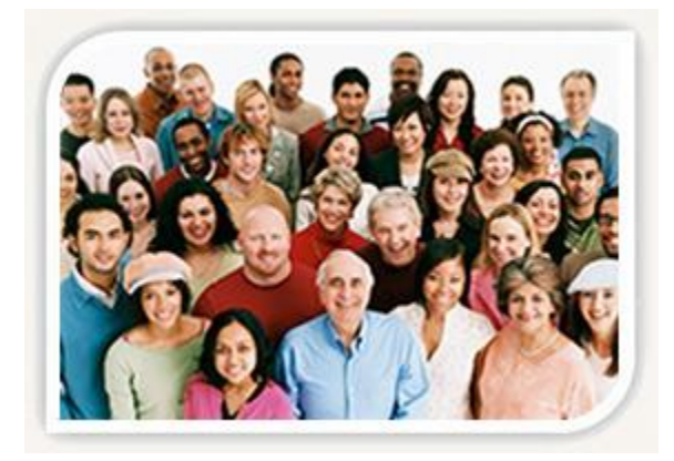
GrandInvolve: Changing the World - One Child at a Time

The GrandInvolve program offers you an interesting and purposeful experience while making a difference in a school – a classroom – a family – or in one child's life!