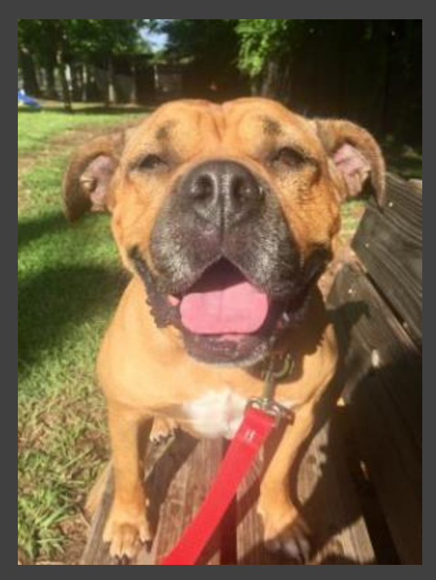
Meet Lola Meatball!