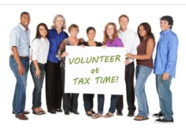
Volunteers needed for VITA 2018!

Northern Virginia families with low-income need your help in preparing their tax returns and assisting the program as greeter, screener, translator, and/or IT support. Pre-register for the Volunteer Income Tax Assistance (VITA) Program 2018 now!