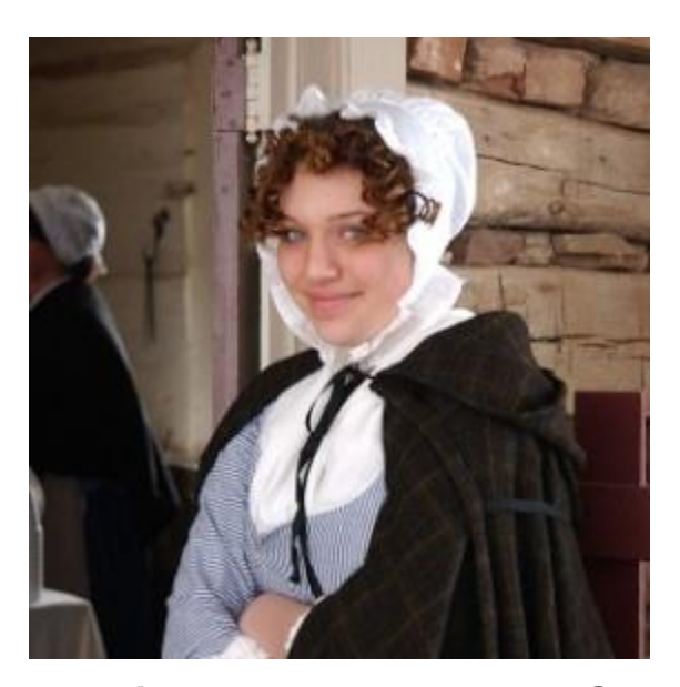
Take Part in Local History as a Volunteer at Sully Historic Site

Sully Historic Site is seeking history enthusiasts. Volunteer Touring and Teaching Docents are needed to lead the public through this important local 18th century historic house museum. No formal experience is required; training will be provided.