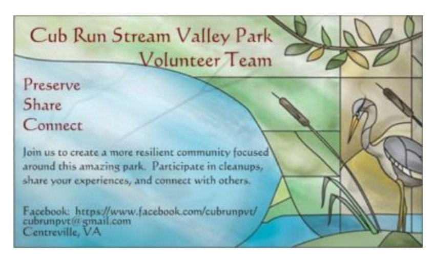
Cub Run Stream Valley Park Volunteer Team

Cub Run Stream Valley Park is the third largest park in Fairfax County, but until recently, has not had a formal group dedicated to supporting it. To fill this need, the Cub Run Stream Valley Park Volunteer Team was formed in partnership with the Fairfax County Park Authority. The mission of the group is threefold: Preserve, Share, Connect . Their plan is to reduce park litter